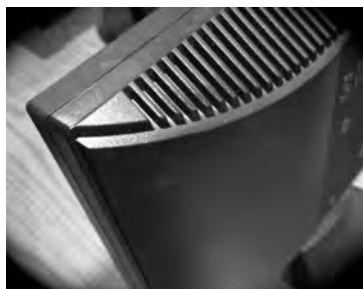
Tapered design Exp #4