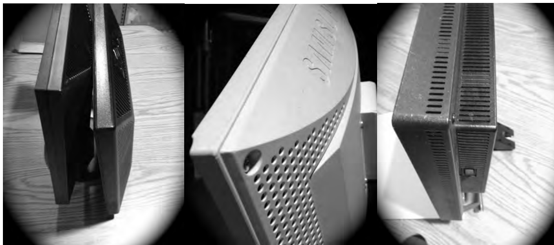
Standard 60 deg bend Exp #1