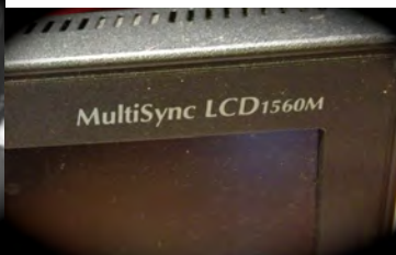
LCD Model # on front